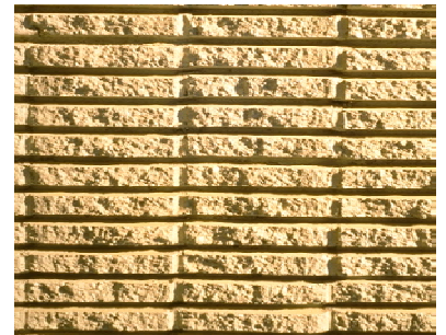
Fluted Rough Face