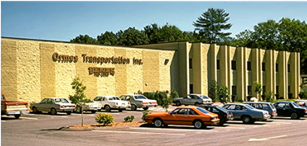
Dymacryl water-repellent stain protects the exterior at Ormes Transportation's new building in Wilmington, MA.