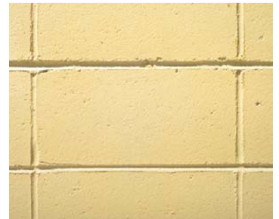
Standard Smooth Face

The new Ormes facility features three types of block, all treated with Dymacryl.